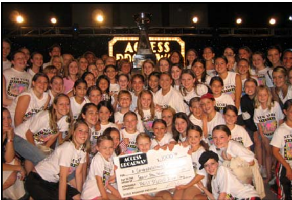
Seven Star School of Performing Arts Winner of 2006 Broadway Cup

Whether you are seeking a once a week class or an intensive program to set your child on the path to a professional career, Seven Star School of Performing Arts is for you. Seven Star School believes in education that inspires young people to be the best they can be. Through proper training, your child will experience a physical activity that will inspire dedication, teamwork, and discipline, as well as other qualities that will last long after their classes are over.